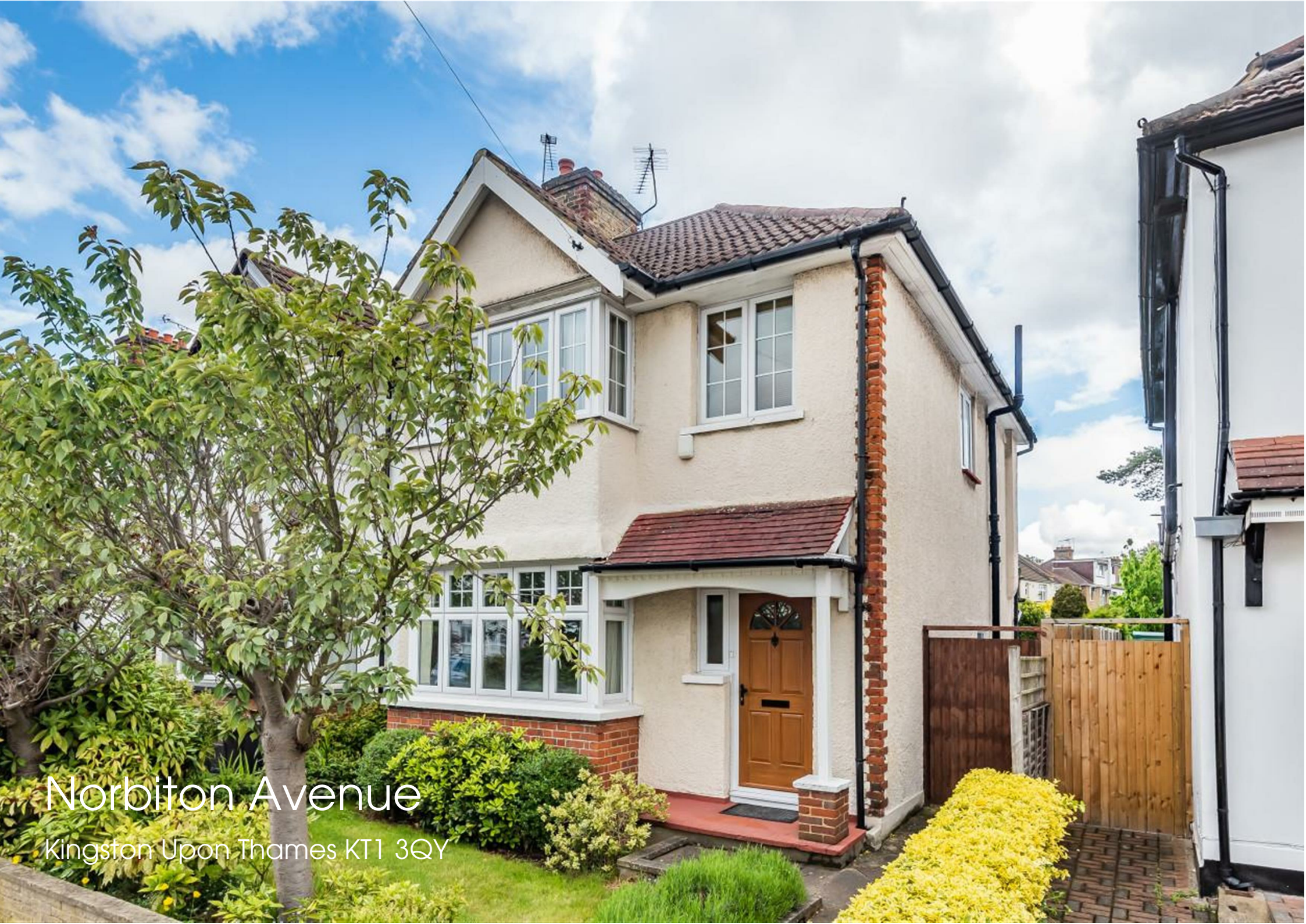
Norbiton Avenue Kingston Upon Thames KT1 3QY

34 Richmond Road Kingston upon Thames Surrey KT12 5ED www.gibsonlane.co.uk Tel: 020 8546 5444